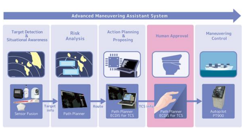
Active human in the loop

Advanced Maneuvering Assistant System, the core technology of the autonomous navigation system, has been granted AiP from ClassNK.